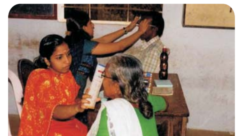
Free eye-care camp in progress

ESAF SHG Federation (Valappad Branch) and