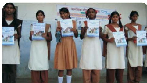
School children displaying posters on good hygiene practices

Activities like Street Plays, Poster Show, and Pamphlet Distribution were organized. The theme of the street play was based on the ill-effects of open defecation, benefits of toilets, and importance of hygienic habits. Awareness program at school was organized in association with Hygiene club. Both students & teachers participated in the program.