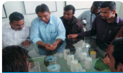
The training for FINISH Project staff in progress

Two days training program, for Financial Inclusion Improves Sanitation and Health (FINISH) project staff, was organized on Feb 09 and 10, 2010 at ESAF Training Centre - Nagpur. The Objective of the programme was to train the participants regarding the FINISH Project and to discuss the plans and strategies. They also discussed on issues like sanitation obstacles. Valentine Post from WASTE guided the participants on the supportive tools. Later the participants were divided into three groups for field visits and each group visited different areas like Sewerage Line at Sirispeth,