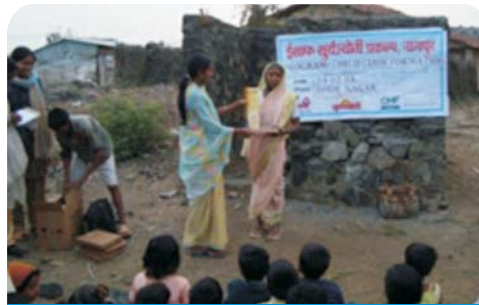
Distribution of solar lamps in progress

In order to create awareness among the locals related to solar light ESAF staff mobilized people from the community including hawkers in the Nagpur Area. Solar Lamps were distributed by