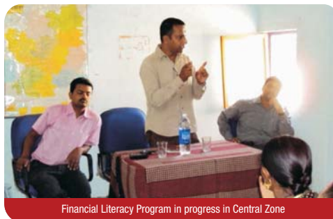
Financial Literacy Program in progress in Central Zone